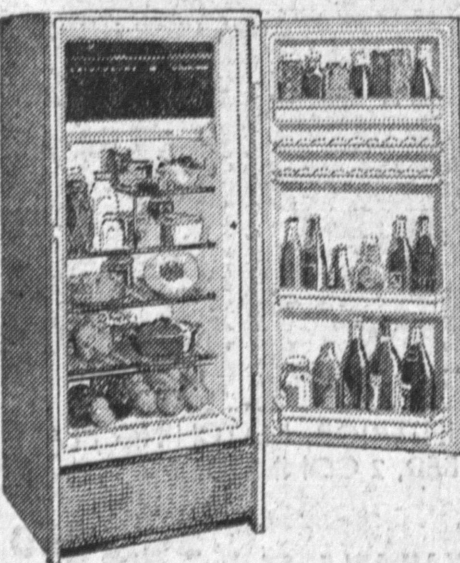
Two-door, 2-in-1 Foodkeeper with separate bottom freezer

Big . 10.1 cu. ft. Refrigerator section with 2.41 cu. ft. locker-top Food Freezer keeps 84 Here is every basic Frigidaire feature includer-all cooled with constant just-right Flow- cubes ready and waiting. ing Cold.