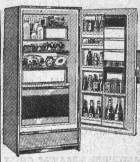
Favorite 2-Door Combination now with new In-a-Door Ice-Ejector

heatless Cycla-Matic Defrosting, 4 easy-glid- lbs. frozen solid; separate door features Fro- ing full-width Super Freezer Chest with two cu. ft. Food Freezer across the bottom. ing Roll-to-You Shelves, Counter-High Food Bar, feature-packed Pantry Door with Picture Window Hydrator and Butter Condition- exclusive Ice-Ejector that keeps 3 lbs. of Porcelain-finished Food Compartment with