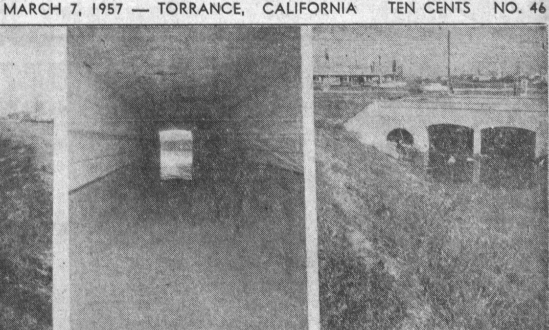
THS IS UNFENCED DOMINGUEZ CHANNEL WAITING FOR ITS INEVITABLE VICTIM A resolution has been passed by the Torrance City Council demanding protection from the county. Similar requests have been ignored in the past .- Press Photos by Bill Robison.