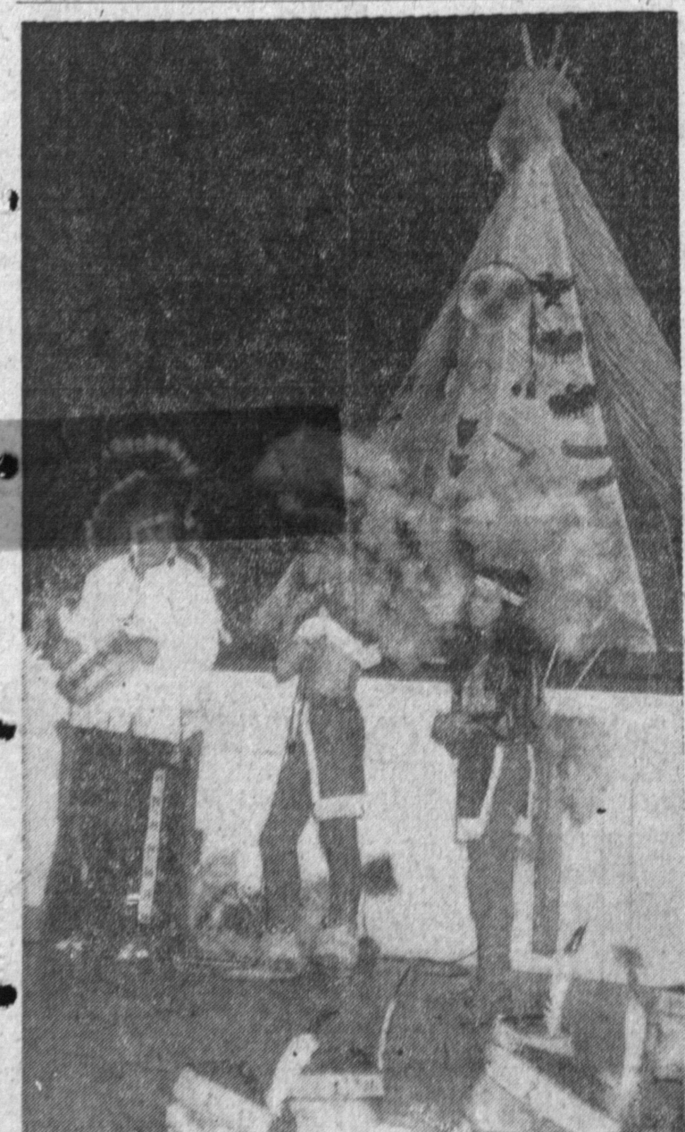
10 MORE Y-INDIAN GUIDE TRIBES More than 300 dads and sons attended the induction of 10 more Y-Indian Guide tribes at the Civic Auditorium last weak. This is one of the many activities provided for local youngsters by the local YMCA presently conducting a fund-riasing drive which has reached the two-thirds mark

of the Torrance YMCA Fund lington, Cabrillo, Eshelman, radrive, announced that the drive ther than continue down Arlinghas reached the two-thirds mark ton to Narbonne, he said. with $16,563 reported thus far.