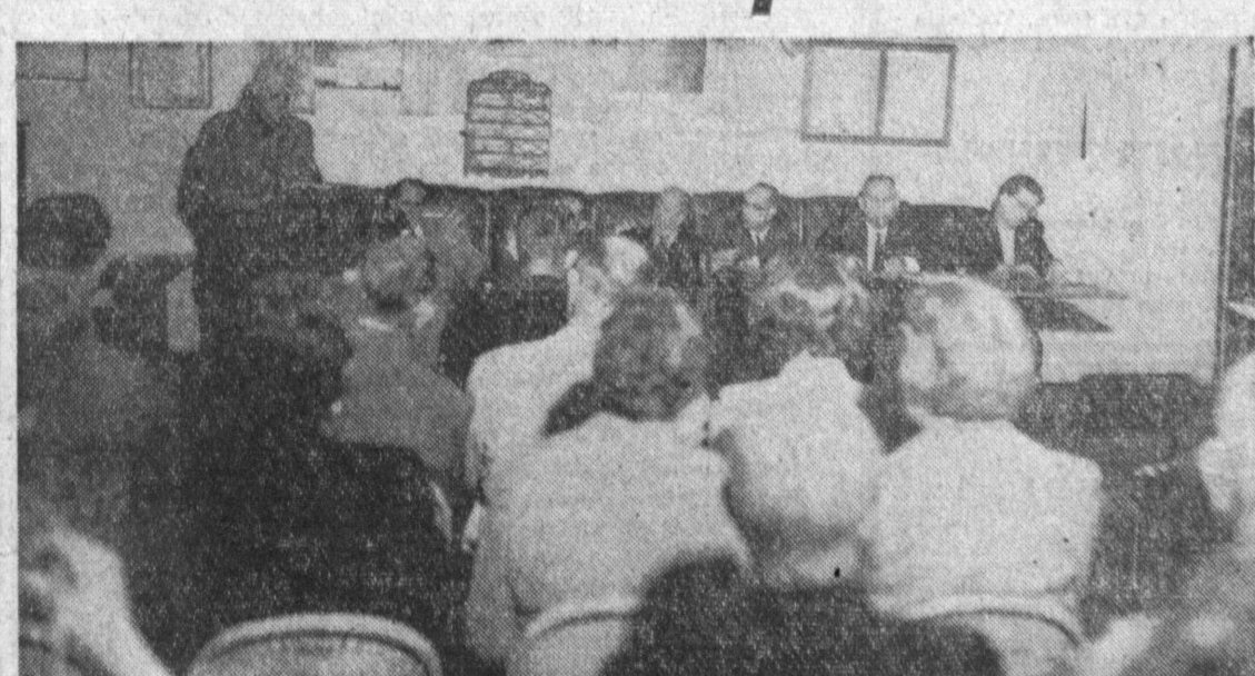
STATE COMMITTEE State assemblymen heard testimony Monday regarding incorporation, annexation, and status quo troubles in Lomita.