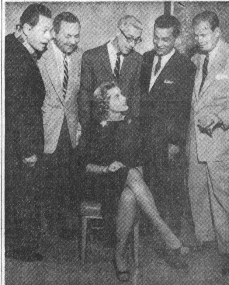
DEEJAYS AND FRIEND

Displayed in their window will be a Gold Seal