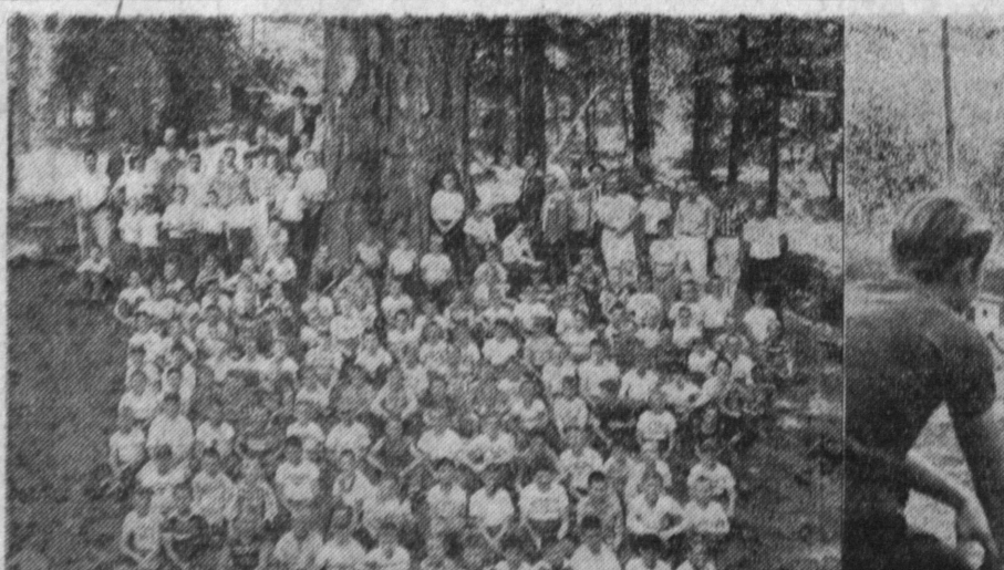
CAMPING The Torrance 'Y' sent 550 youngsters to camp.

The accomplishments of the local YMCA during the last (Turn to Page 11)