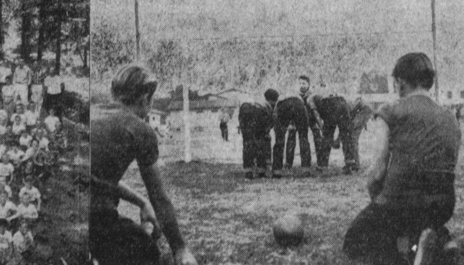
FOOTBALL LEAGUES It operated football leagues for 400 boys.