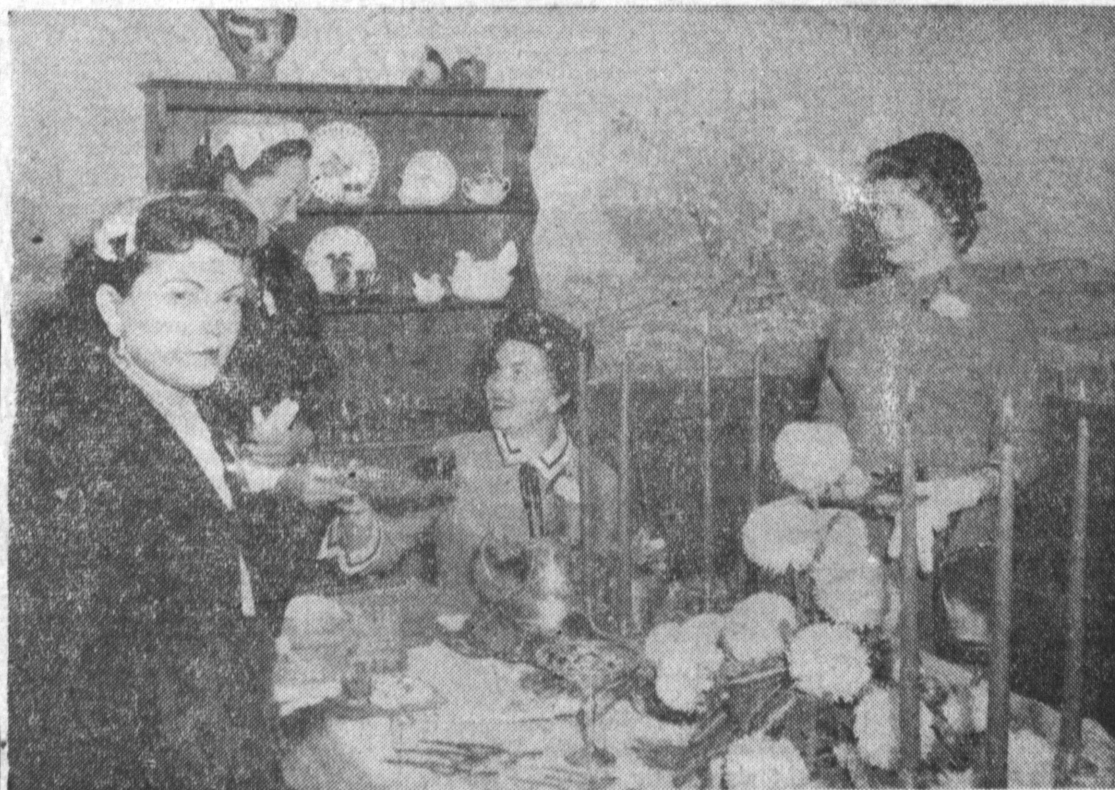
Festive Tea Table at Melville Home