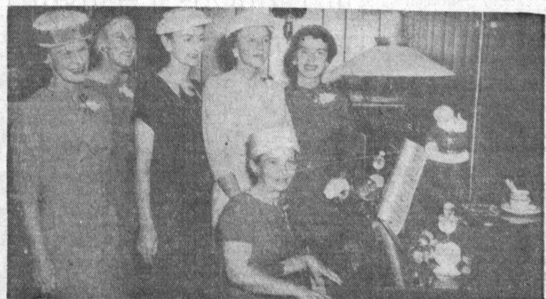
Honored Guests at Colorful Christmas Tea