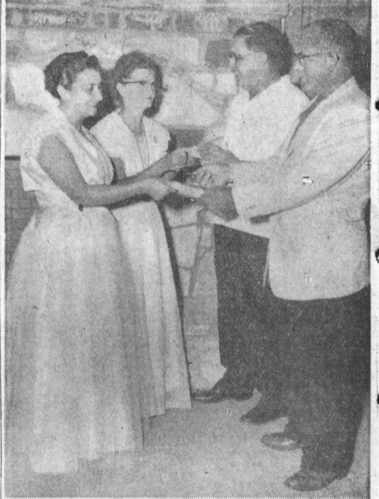
Royal Neighbors Sell Tickets

bombing was not accidental, of "affiliated with" Vimoutiers in ficial preparation could not be its struggle to rebuild during Baptism Rites Performed made. Pilot International has the past seven years.