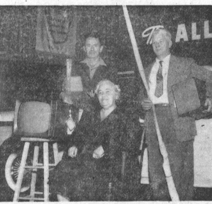
1957 FORD SHOWING

ON ALL CHRYSLER PRODUCTS OPEN EVENINGS 1600 CABRILLO FA. 8-6161