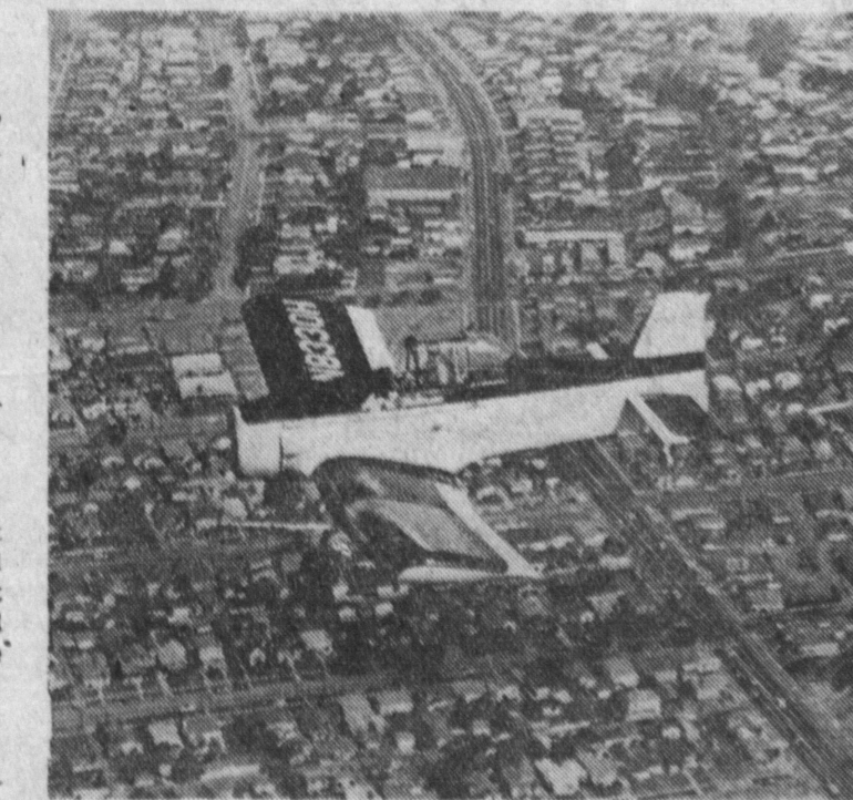
BOYHOOD DREAM TAKES FLIGHT Transland company's Ag-2, agricultural and forestry airplane shown during its maiden flight at Torrance. Designed specifically for all types of aerial application of dust and liquid shemicals, fertilizing, seeding, and forest fire fighting.

This five-year project brings to aviation and the aerial (Turn to Page 30)