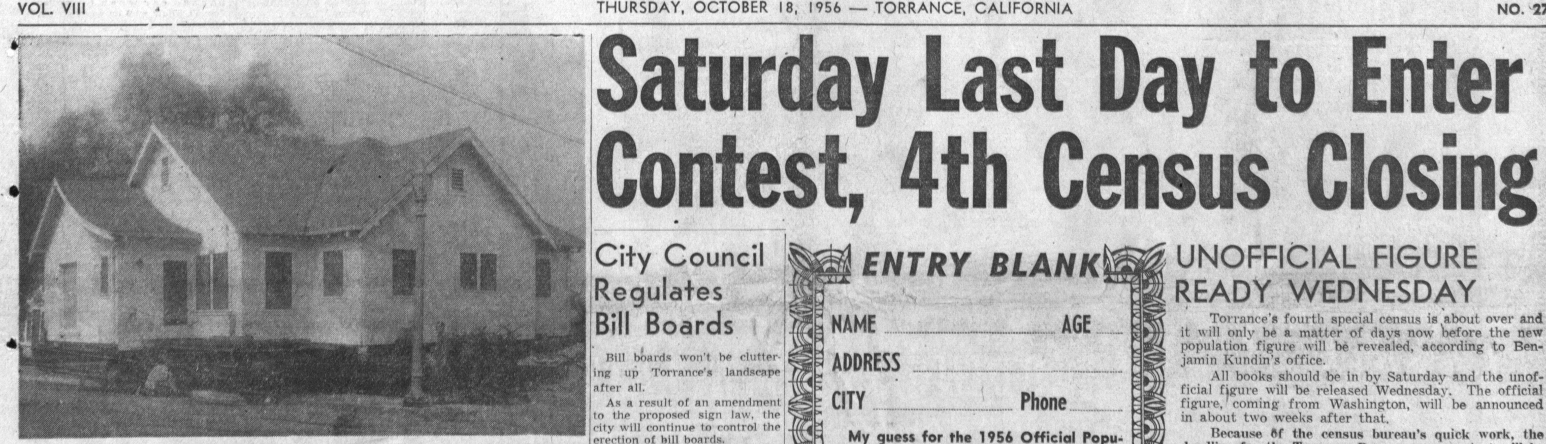
MORE PARKING FOR DOWNTOWN TORRANCE

This house at 1517 Marcelina was taken away last week in order to provide additional off-street parking areas in downtown Torrance. Other efforts to provide more parking include the razing of the old fire station and the modernizing of the city-owned parking lot at Cravens and El Prado.