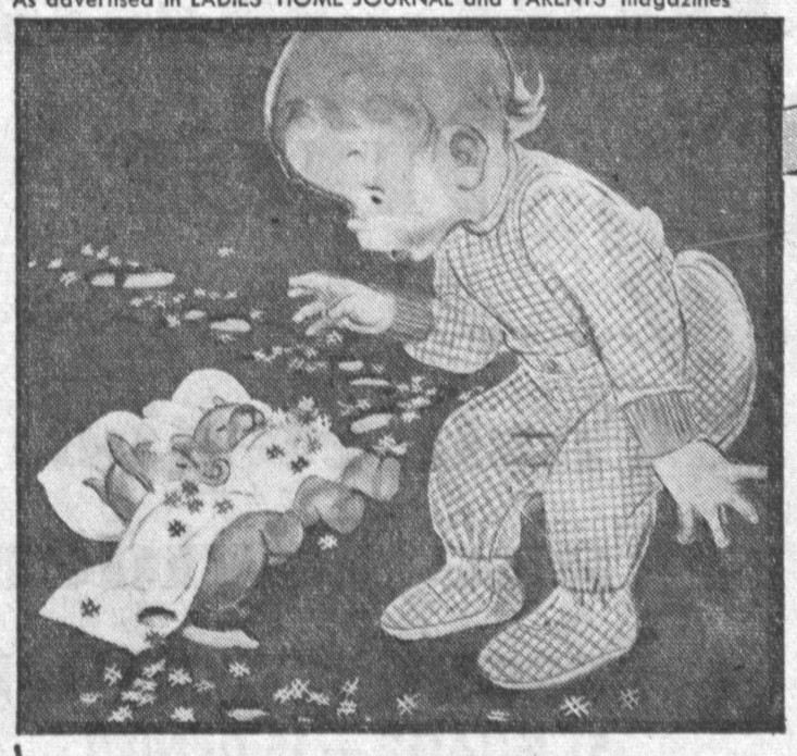
PIN CHECK SLEEPER Nevabind sleeves. Snap-fastened "Gro-Feature" at waist. In Pink,

As advertised in LADIES' HOME JOURNAL and PARENTS' magazines