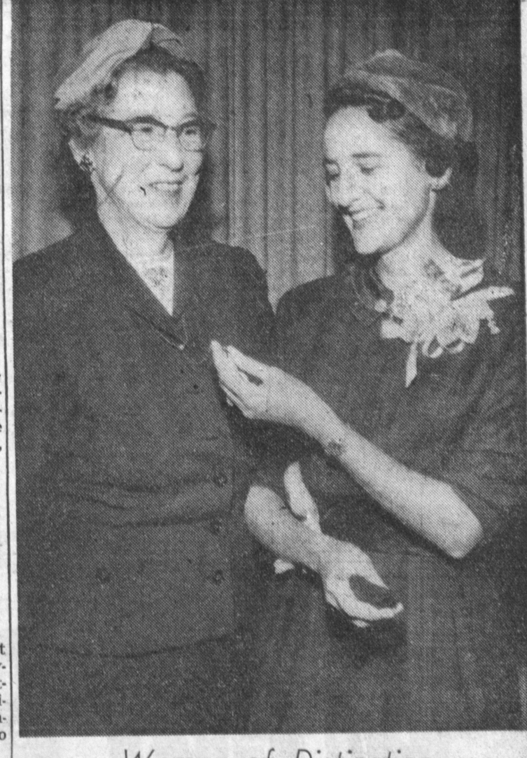
Women of Distinction

cherries, tossed green salad, the year. Anything can be sold playing. Students will be expumpkin pie with whipped 2345 and parade your goods game.