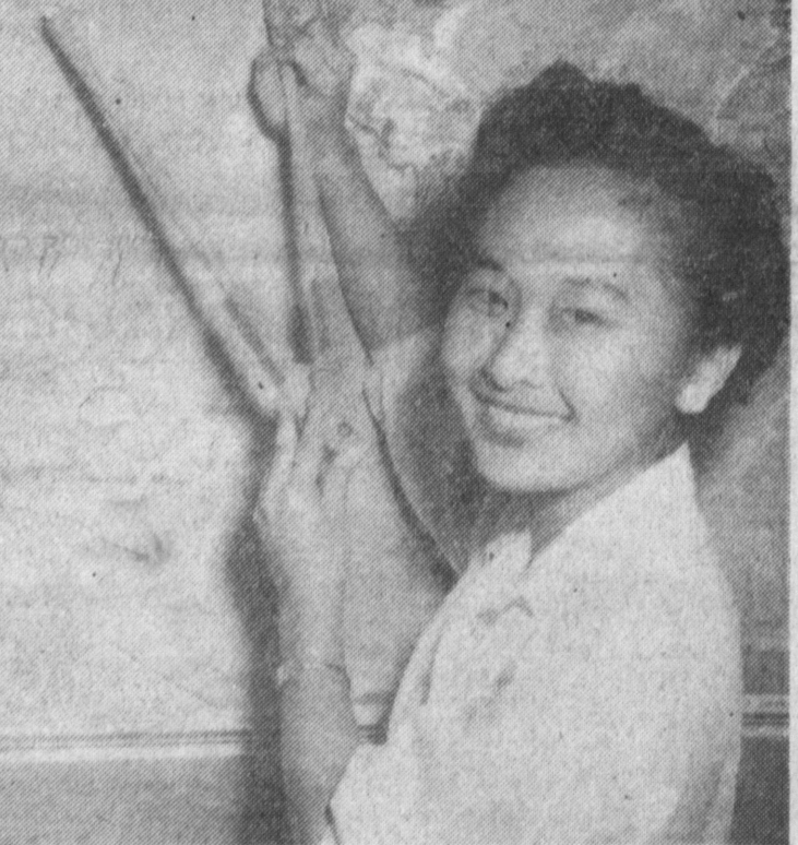
FROM THE ISLAND TO THE MAINLAND

merchandise to buy, no bottle tops to trade in, no trips to 1406 Cravens Ave., Torrance, Calif. make-all you have to do is fill in the coupon with your guess and see that it gets to our office one way or the other.