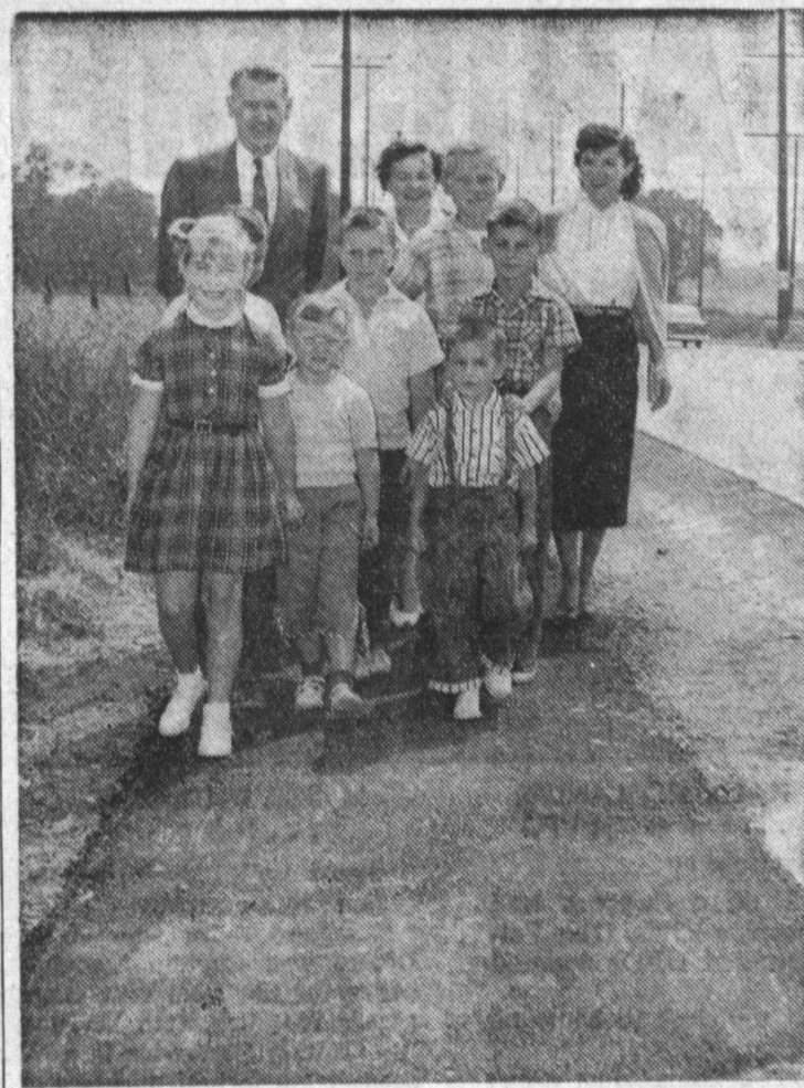
TESTING NEW WALK

OTHER OFFICES IN WHITTIER, FRIENDLY HILLS, TEMPLE CITY, PUENTE AND MONTROSE