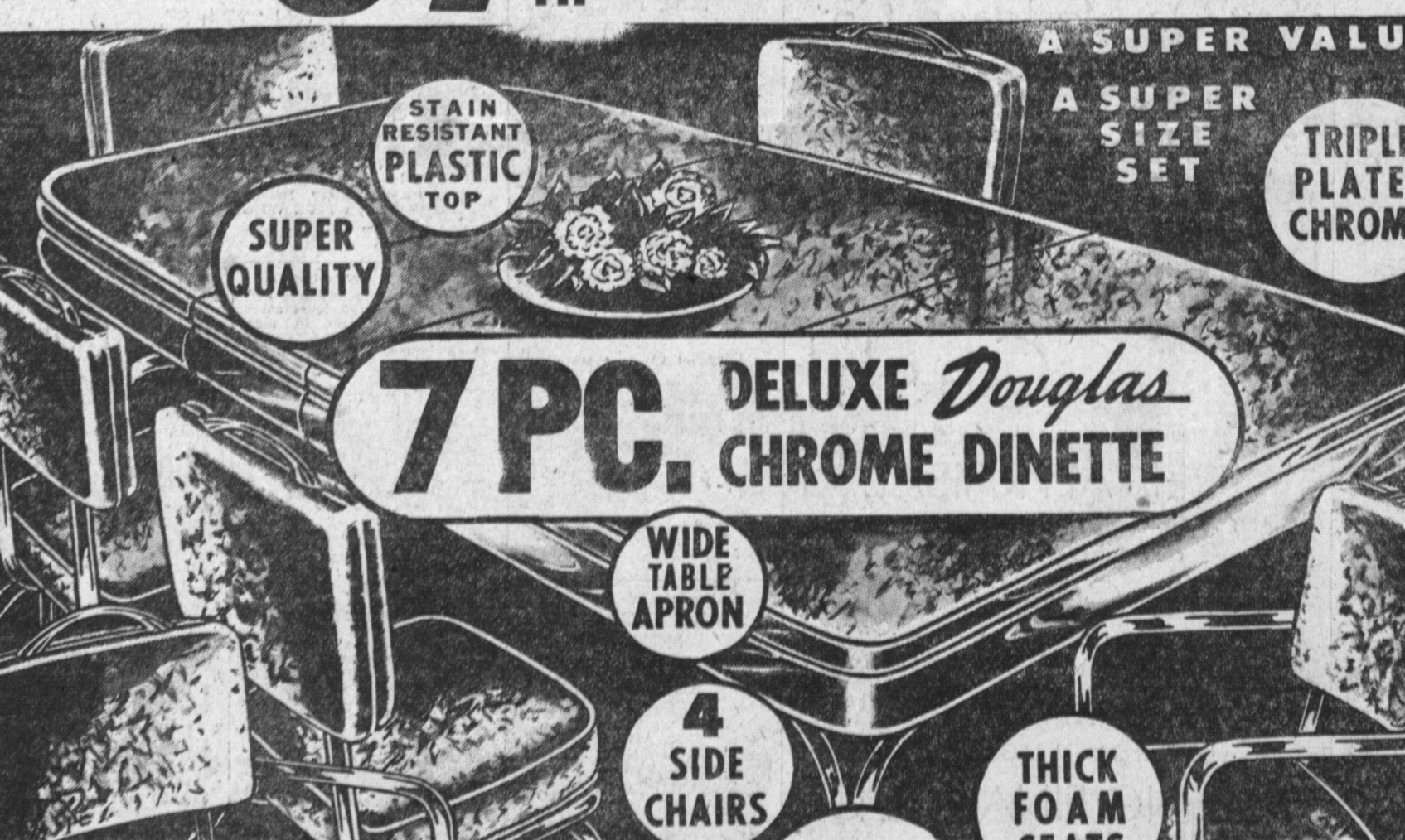
TABLE EXTENDS TO 36"x 72" HOST'S ARM CHAIRS