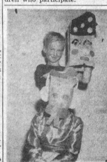
IT'S IN THE BAG

Hollywood Riviera offers needs and the interests of children who participate.