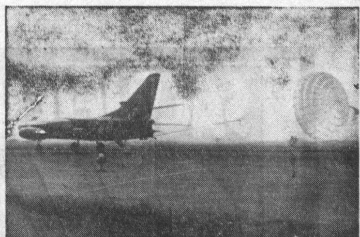
SHOOT THE CHUTE

one ocean, completing a mid-The ground breaking cere- has been appointed manager of tilt-up type construction with will normally stop it in a short Housed in the tail section continent bombing mission, and