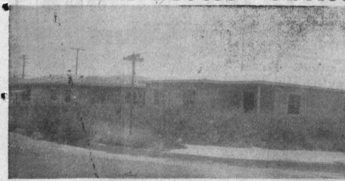
SOME HOUSES BY THE SIDE OF THE ROAD Not only the weeds but the houses, too, are going to seed. These State-owned houses at 182nd st. and Falda are going to pot. Some are empty and put to uses not strictly domestic .

of putting up with unsightly, unhealthy and questionable shacks on the south Merchants side of 182nd st. west of Crenshow blvd., have written a letter of protest to Governor Goodwin Offering The dilapidated houses are