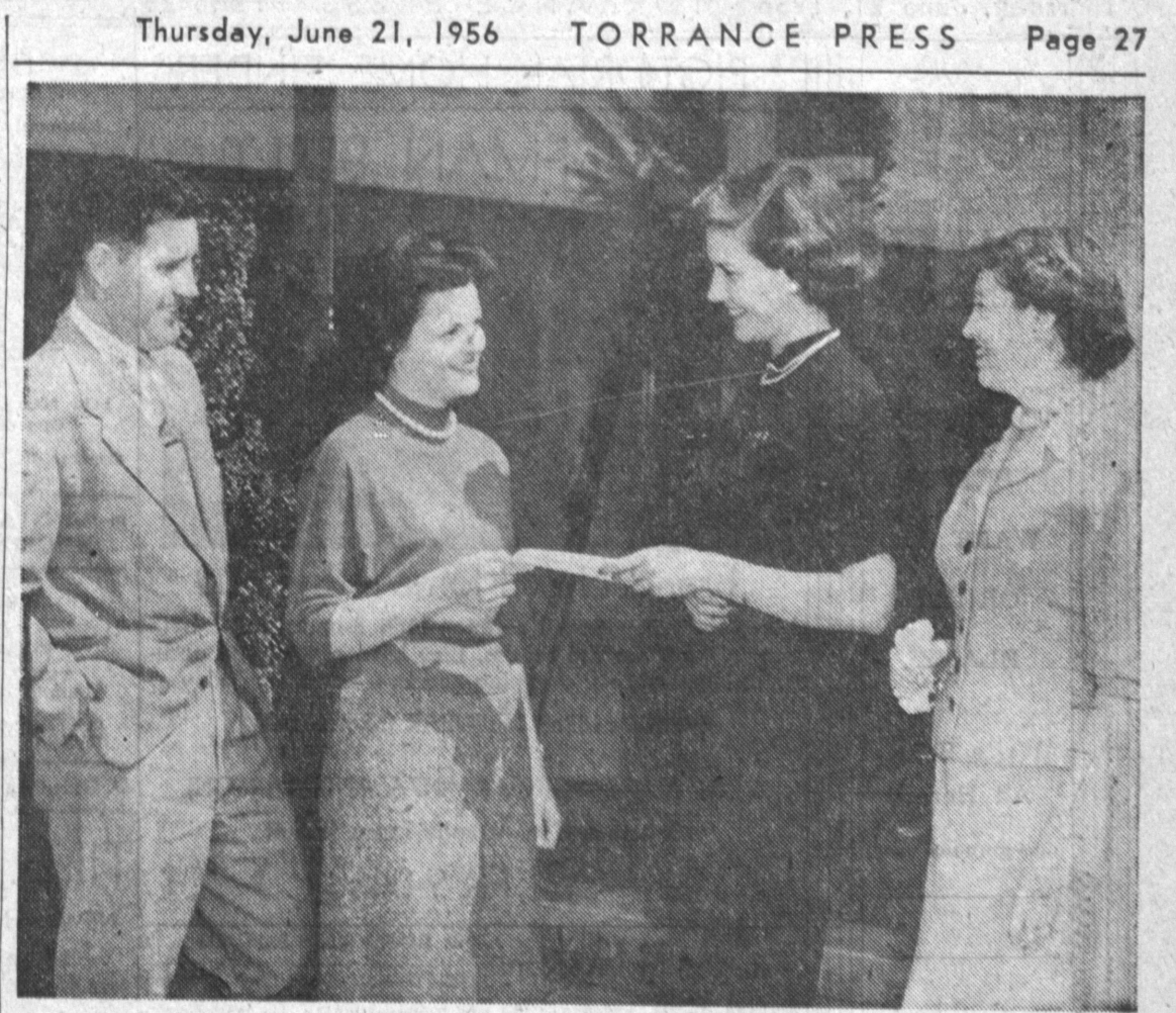
Take a Letter, Miss Porter

Hawaiian Olympics One of the colorful and unique events of the day is the Hawaiian Olympics. Around a square about the size of a baseball diamond sit groups of a dozen athletes representing each of the major islands—Kauai, Oahu, Molokai, Maui, and Hawaii. Decked out in rickish coconut hats with hibiscus flowers and wearing their island colors they squat behind a display of island fruits: pine-