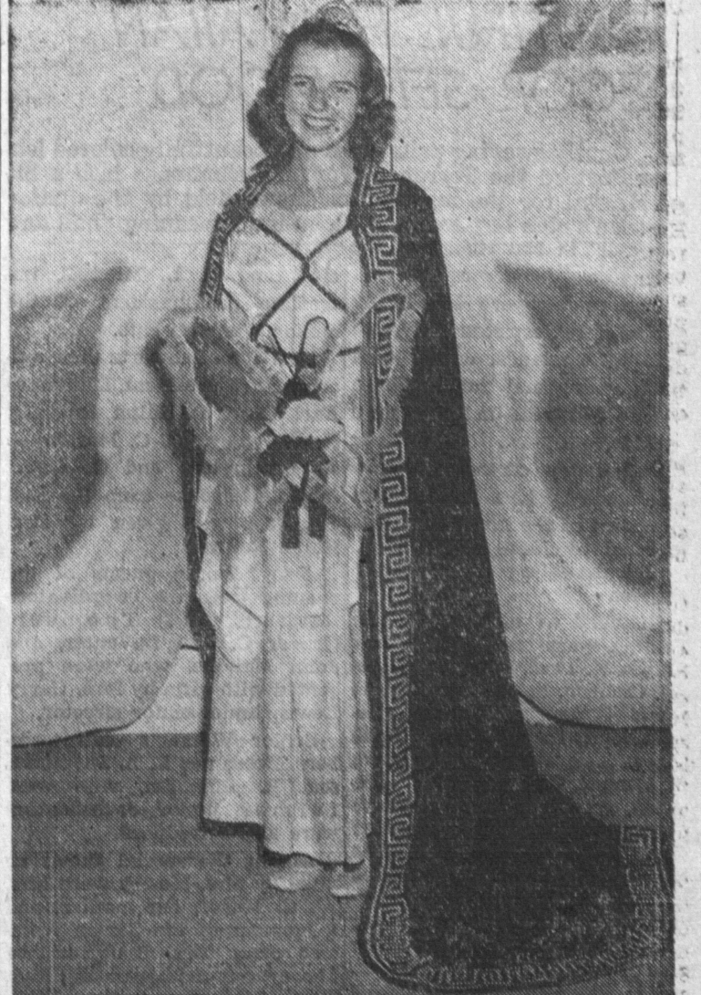
Honored Queen Installed