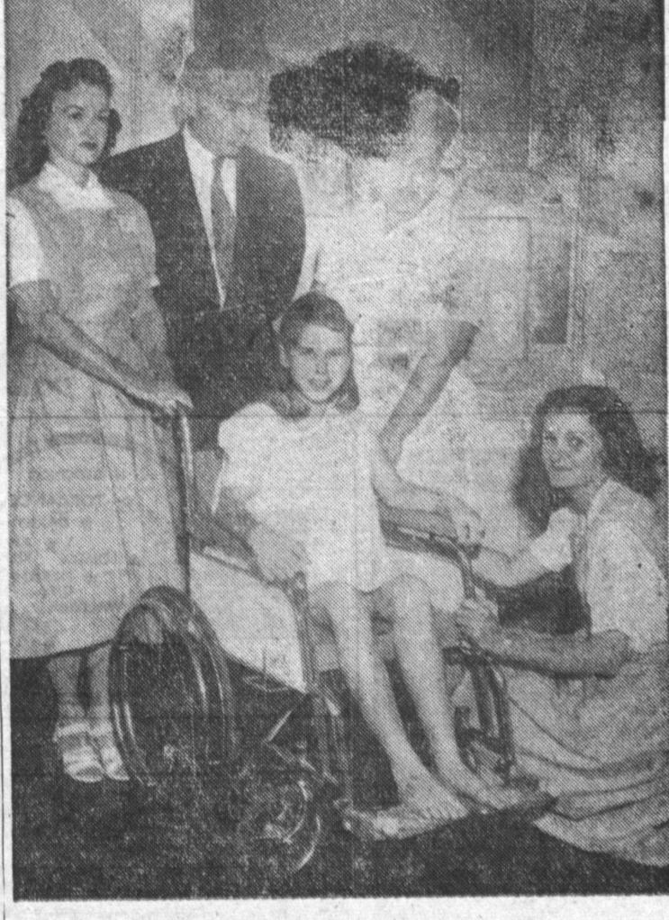
FOR THE CHILDREN

flection of the Love of God upsition should that be necessary. read