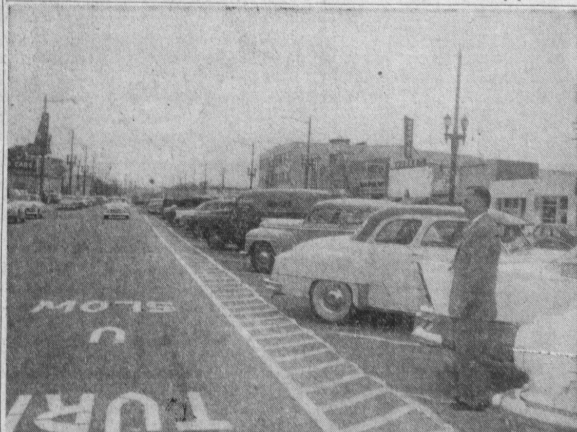
THOUGHT INTO ACTION

politan water district, is also on trousers, and a dark jacket, was $46,000. The increase is the result of increased population.