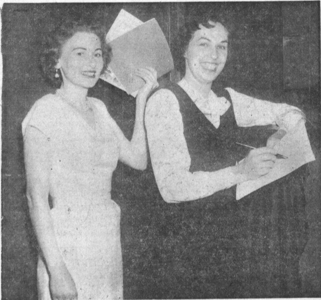
They Won Honors for the Juniors