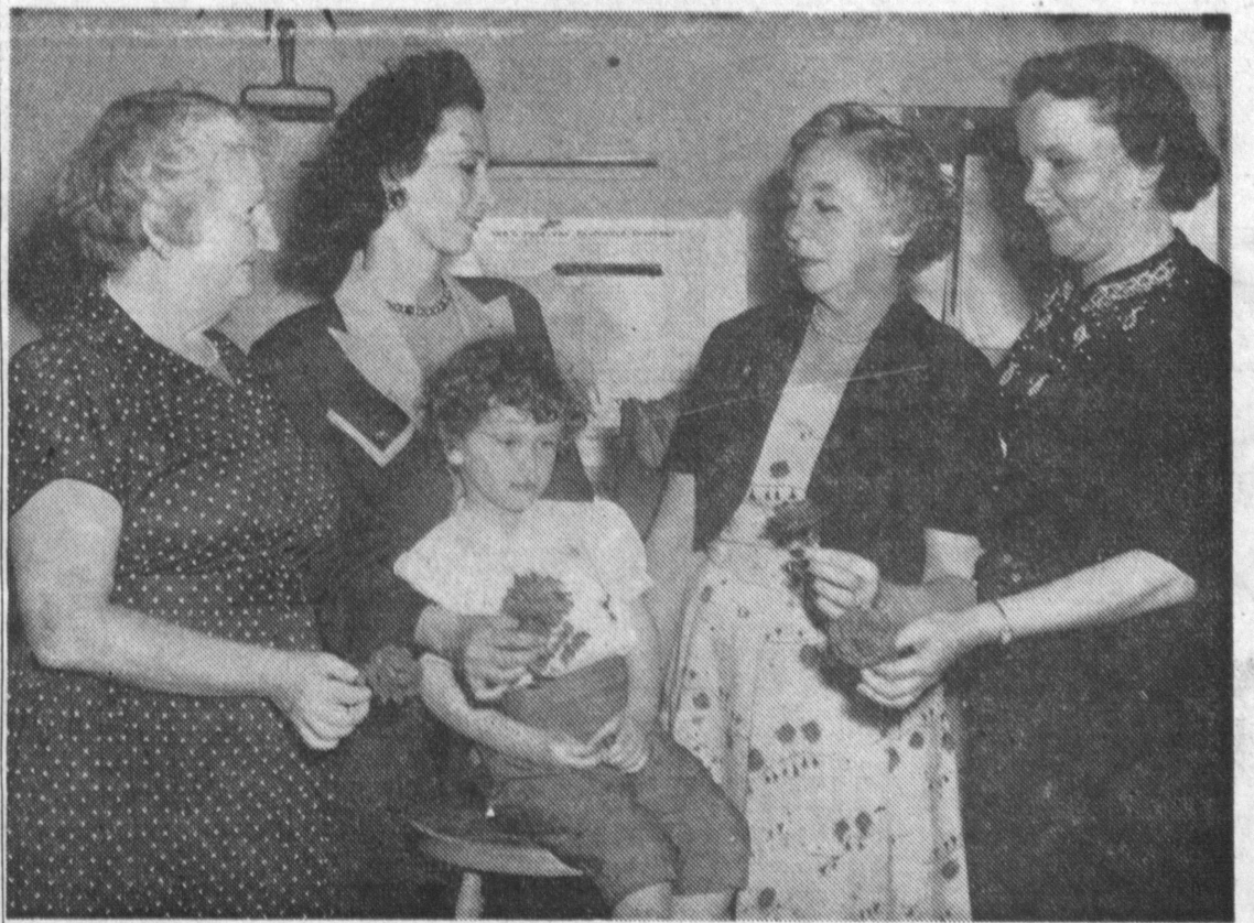
Sweets to the Sweet

To place your ad, call FAIR-fax 8-2345 or write the TORRANCE PRESS, 1406 Cravens, Torrance.