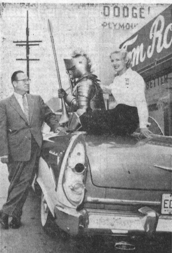
THE GOLDEN LANCER

To place your ad, call FAIRfax 8-2345 or write the TORRANCE PRESS, 1406 Cravens, Torrance.