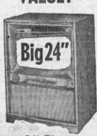
Table TV on matching table base (optional extra for base). Bright, clear.

aluminized picture. Best picture of the year . . just great!