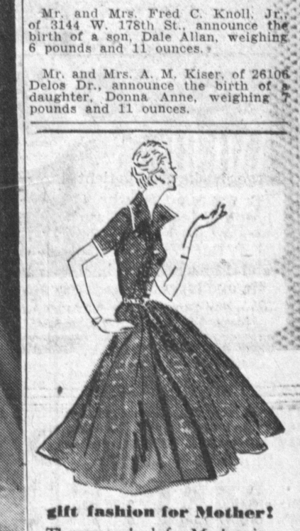
The young look for Mother in pretty dresses to wear all summer long. from 3.99 to 8.99.

MODE O' DAY Corner of Post & Sartori Ave.