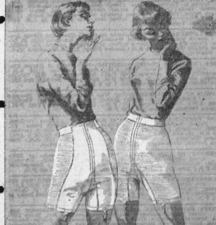
A new world of comfort in your