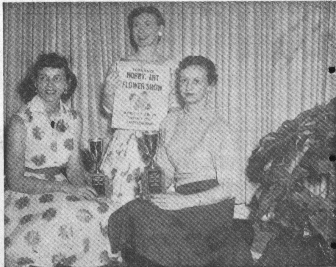
For the Winners