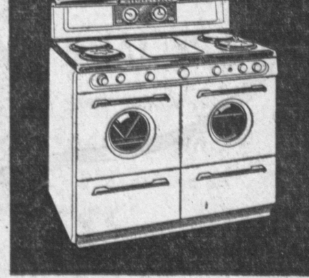
New Automatic GAS Range shown: WESTERN-HOLLY. Other makes featuring Top Burner Temperature Control are: Caloric, Florence, Gaffers & Sattler, Hardwick, Magic Chef, O'Keefe & Merritt, Roper, Wedgewood.

3. THINK WHAT THIS MEANS: Every pan you own becomes fully automatic! You enjoy more delicious, more digestible fried foods... easier pressure cooking... soups that simmer but never boil! See a demonstration soon!