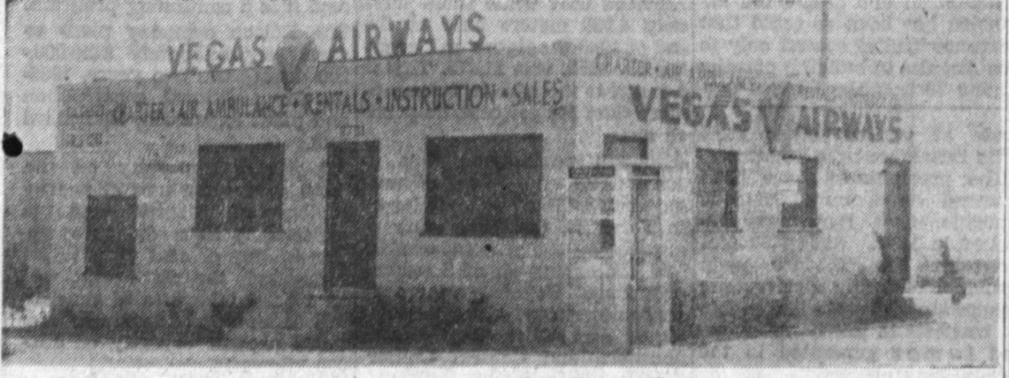
ALL PHASES OF FLYING

Vegas Airways, located on the Torrance Municipal Airport, is the only CAA approved flight school on the field as well as a veteran approved flight school. It offers courses in all flight training.—Press Photo.