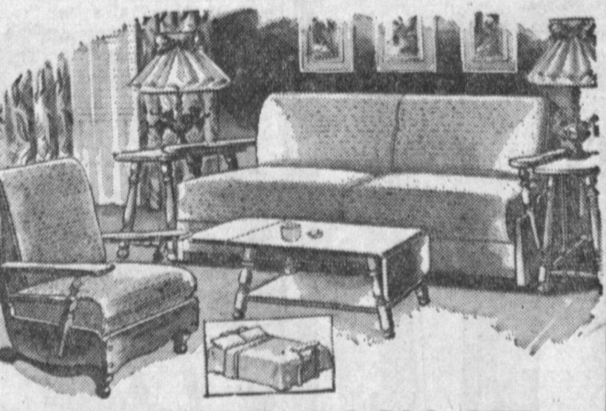
2-PC. LIVING ROOM SET

Drop Leaf TABLE .. CHAIRS, ea. ..... ...19.50 Table - Four ALL FOR ONLY .....127.95 Matching Mate Matching Hutch .....119.50 Chairs.