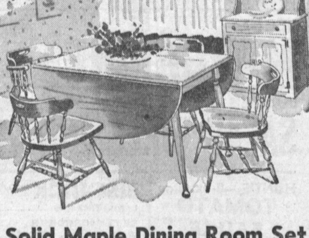
Solid Maple Dining Room Set

Drop Leaf TABLE .. CHAIRS, ea. ..... ...19.50 Table - Four ALL FOR ONLY .....127.95 Matching Mate Matching Hutch .....119.50 Chairs.