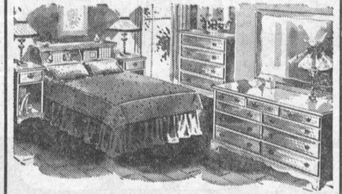
ALL EASTERN HARDWOOD, SALEM