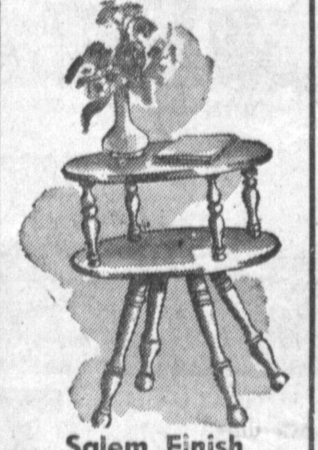
Salem Finish HARDWOOD MAPLE LAMP TABLE