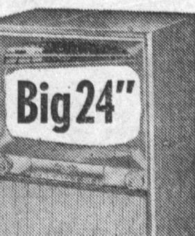
Table TV on matching table base (optional extra for