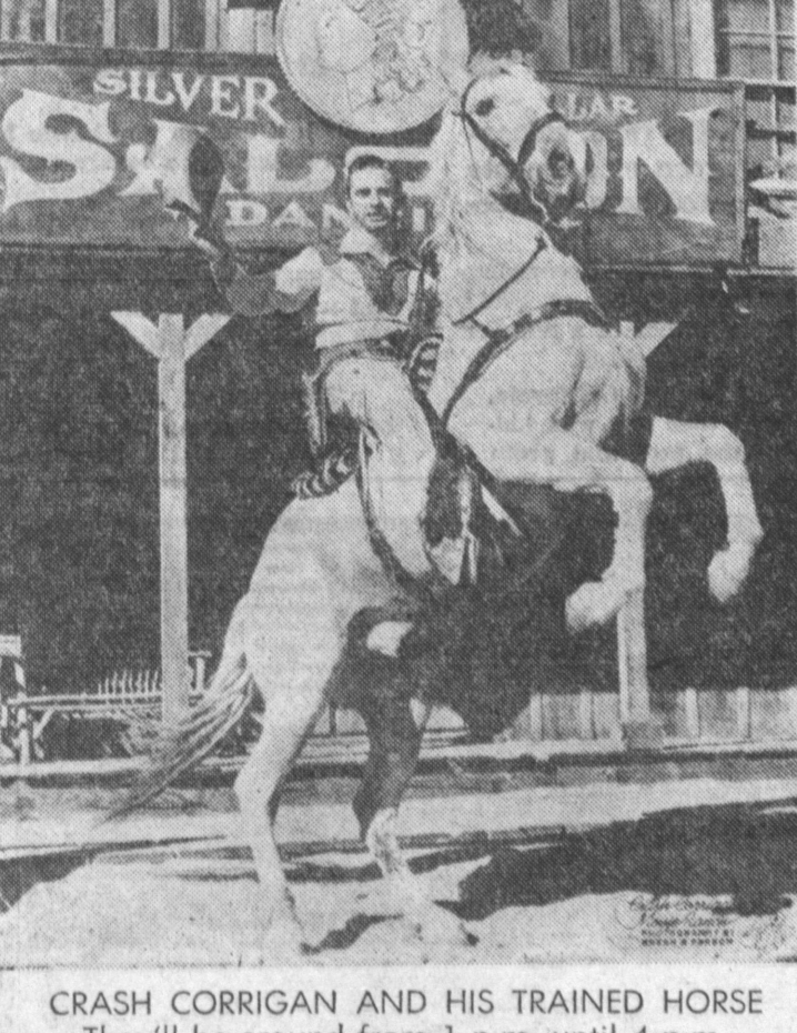
They'll be around from 1 p.m. until 4 p.m.

important for the country to its readers. provide park and recreational services for youth as a means of preventing juvenile delinquency than it is to spend huge sums in building larger juvenile halls and jails.