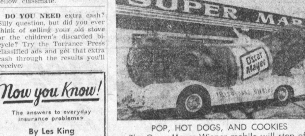
The Oscar Mayer Wiener mobile will stop off from 12 noon until 1 p.m.