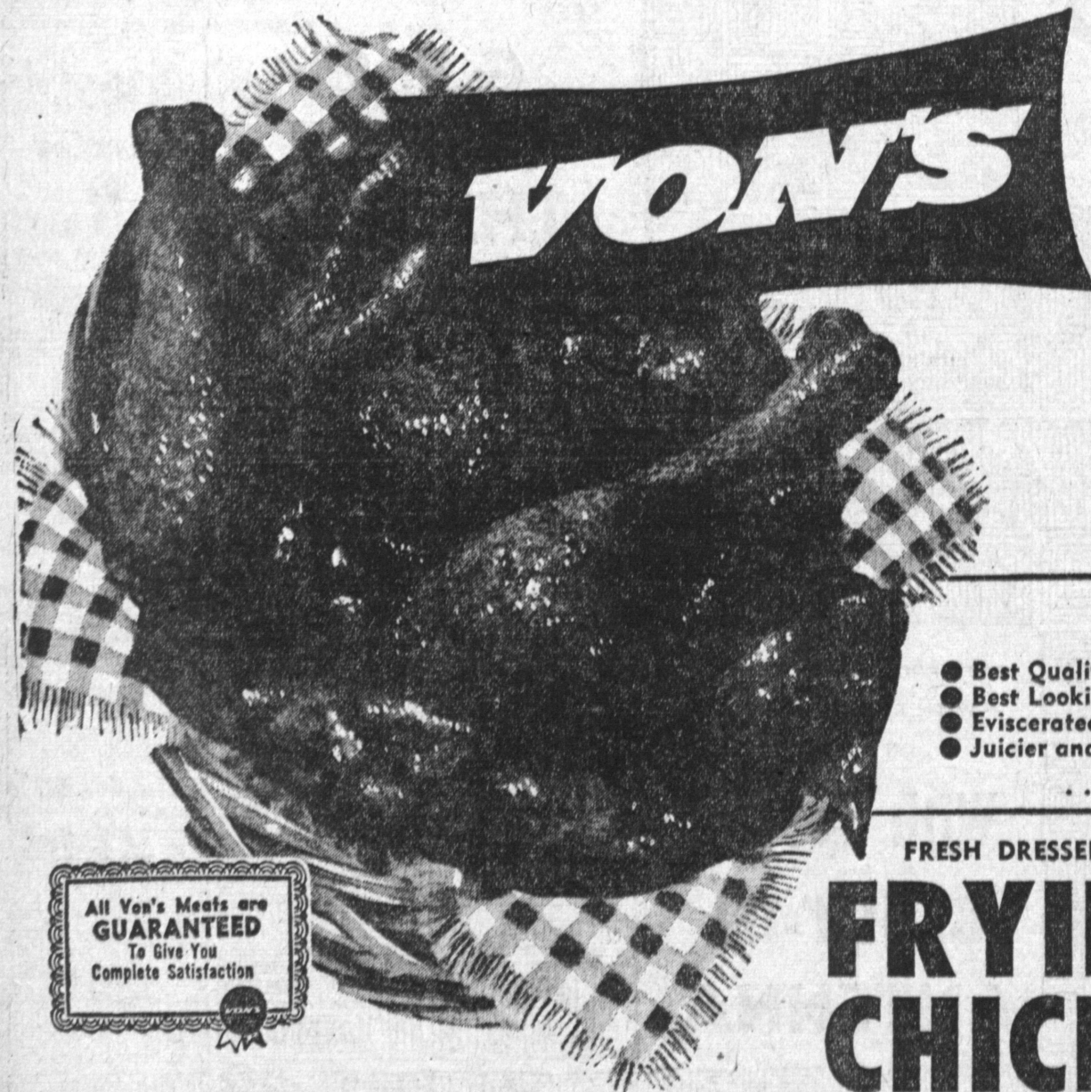
Table-King FRYERS are the best!