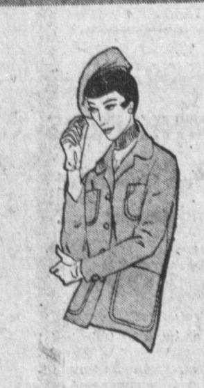
Reg. $4.95 to $5.95 Casual Jackets

Finger tip length, all new spring colors.