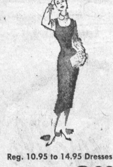
All marked down