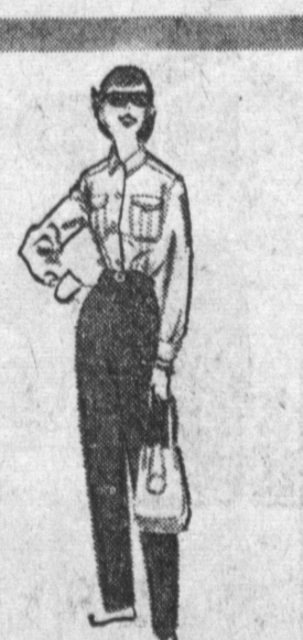
Reg. $10.95 Slacks