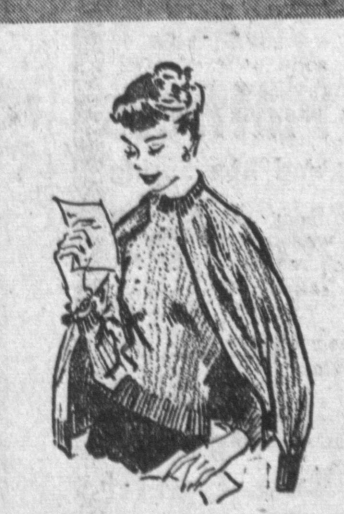
Reg. 5.95 Slip-ons Made of "Mazet" Orlon, Fin- 2.99 est of Orlons. Marked down to Reg. $6.95 Cardigans "Mazet" Orlon Marked down to