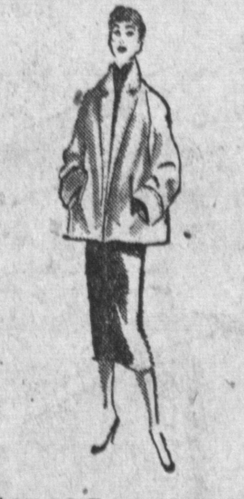
Reg. $27.50 Toppers

Finger tip length, all new spring colors.