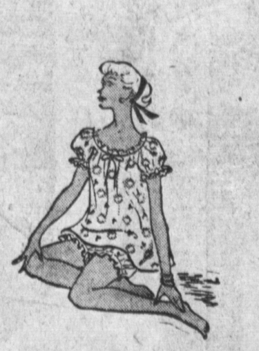
Reg. $4.95 to $5.95 Baby Doll PJ's Cotton - Challis - Flannel Marked down to