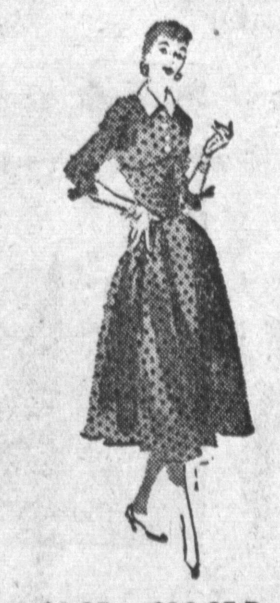
Reg. $8.95 to $10.95 Dresses Special rack marked down