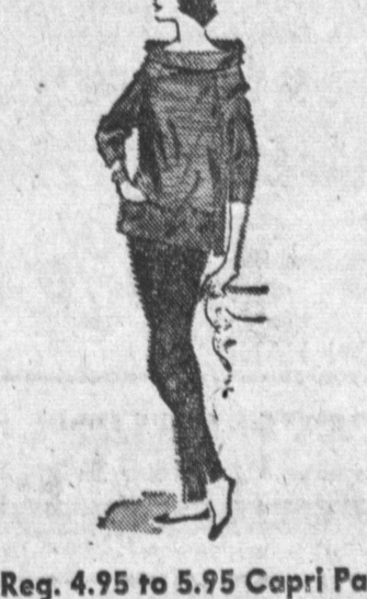
Reg. 4.95 to 5.95 Capri Pants