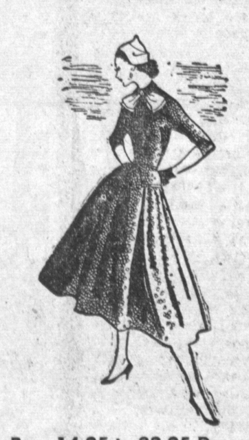
Reg. 14.95 to 22.95 Dresses