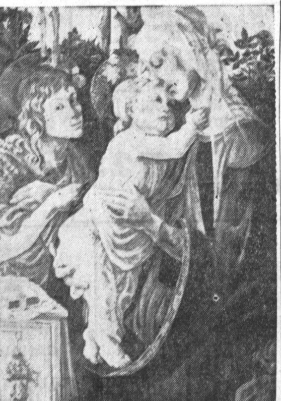
on the Flight to Egypt," Pictured above are student reproductions of Raphael's "Madonna Tempi" and Botticelli's "The Virgin With the