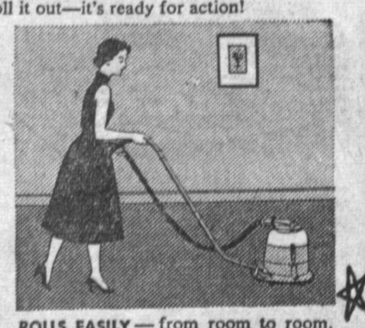
ROLLS EASILY — from room to room, glides over scatter rugs and door sills. Cleaning wand makes convenient