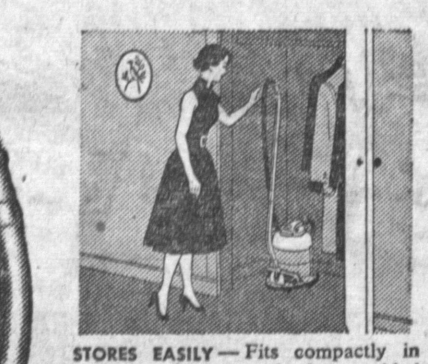
corner or closet, completely assembled just roll it out—it's ready for action!