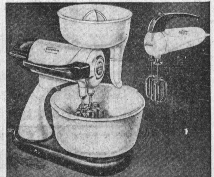
Sunbeam MIXMASTER & MIXMASTER JUNIOR

Exclusive square design cooks 20% more. You get perfect results with controlled heat for bacon, eggs, pancakes, chicken, meats, potatoes, etc. Exclusive WATER-SEALED element for easy washing. You set the dial for the heat you want and - no more cooking failures. Available in 101/2", 111/2" and 121/2" sizes.