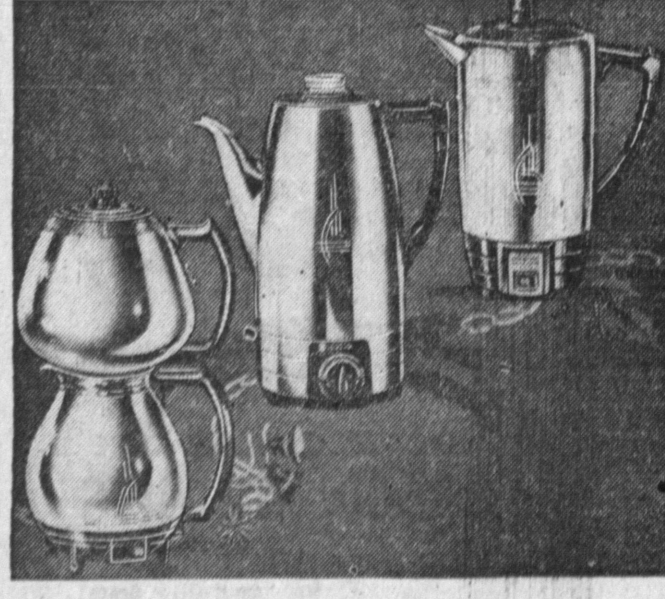
Sunbeam COFFEEMASTER, PERCOLATOR, INSTANT COFFEE & TEA MAKER

America's most popular food mixer. Has all the marvelous features that give you higher, lighter, finer-textured cakes, creamier mashed potatoes, etc. Available in either rich baked enamel or chromium finish. If it's a junior-size mixer—the Sunbeam Mixmaster is the best. Also available in baked enamel or rich chromium.