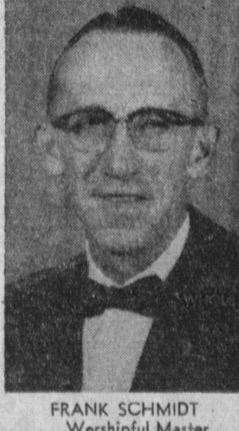
... Worshipful Master