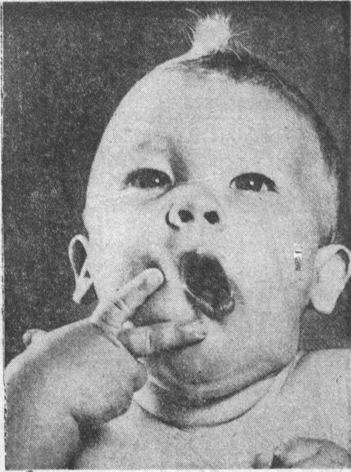
"Wee-ll, we might shave that about 10 per cent"