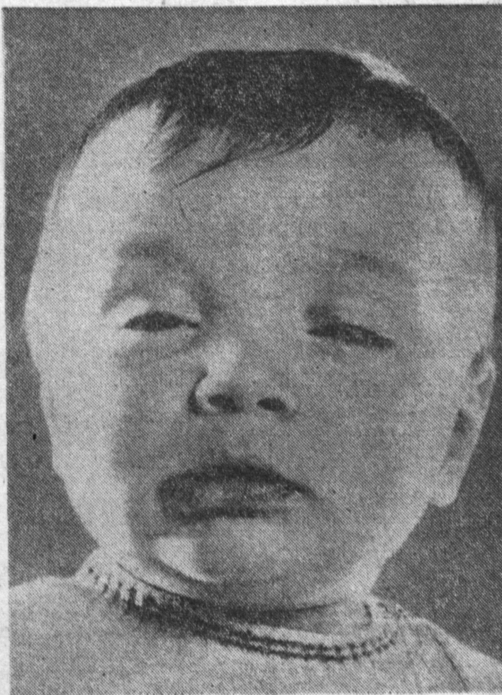
"I got the contract . . . don't ask me how"

CLIP AND MAIL TO T.V. STUDIO • CLIP AND MAIL TO T.V. STUDIO