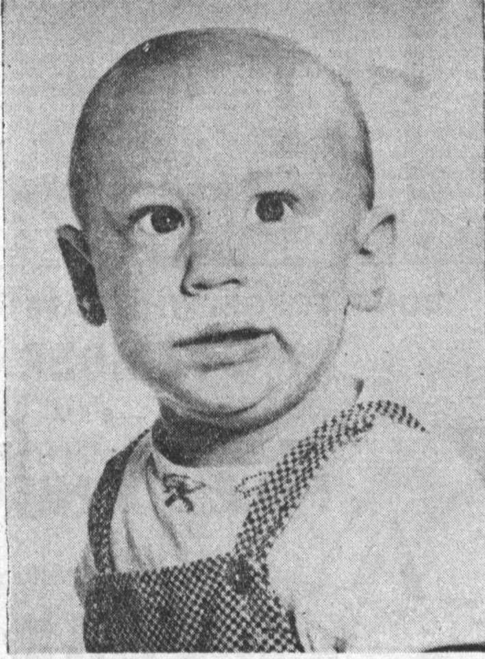
"It'll cost HOW MUCH to fix the transmission?"