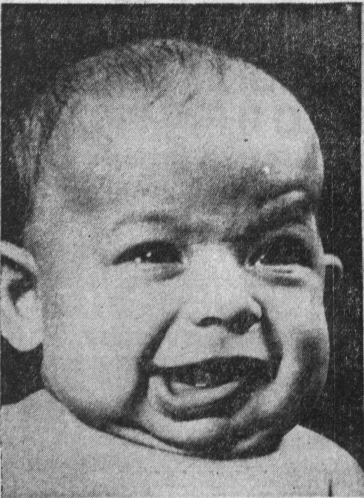
"We won't make a dime . . . but because you're such a good customer"

WE HAVE THE LARGEST SELECTION OF QUALITY T.V. IN THE SOUTHWEST AREA!