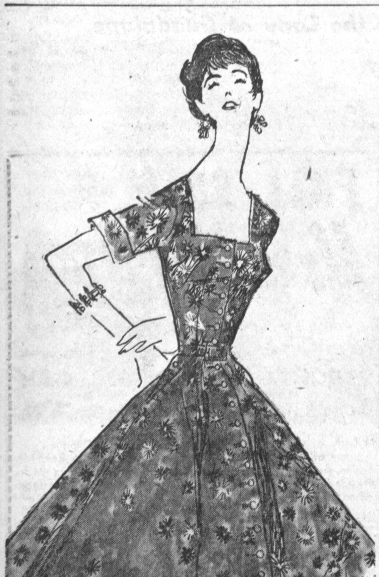
versatile coat-dress in dark cotton 3.99

You're so smart to choose a transition cotton to take you through fall and on into the winter months. Our square neck charmer with autumn floral design is fashioned with a softly flowing line ... full, full skirt and cuffed sleeves; sizes 12 to 18.