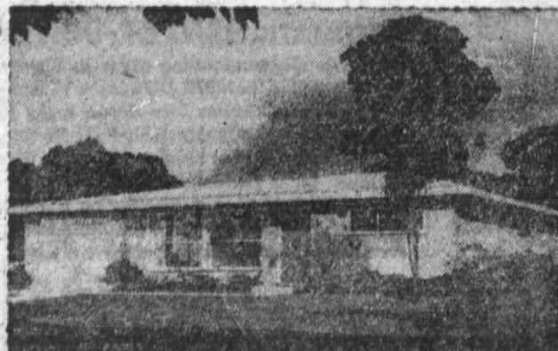
ON YOUR LEVEL LOT

FOR THE MOST WIDELY COPIED 2-BEDROOM HOME IN THE WEST