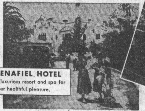
PENAFIEL HOTEL A luxurious resort and spa for your healthful pleasure.

Free recorded Spanish lessons sent to each contestant winner through the courtesy of the Mexican-Spanish Academy of Mexico City. Records will be received prior to departure.