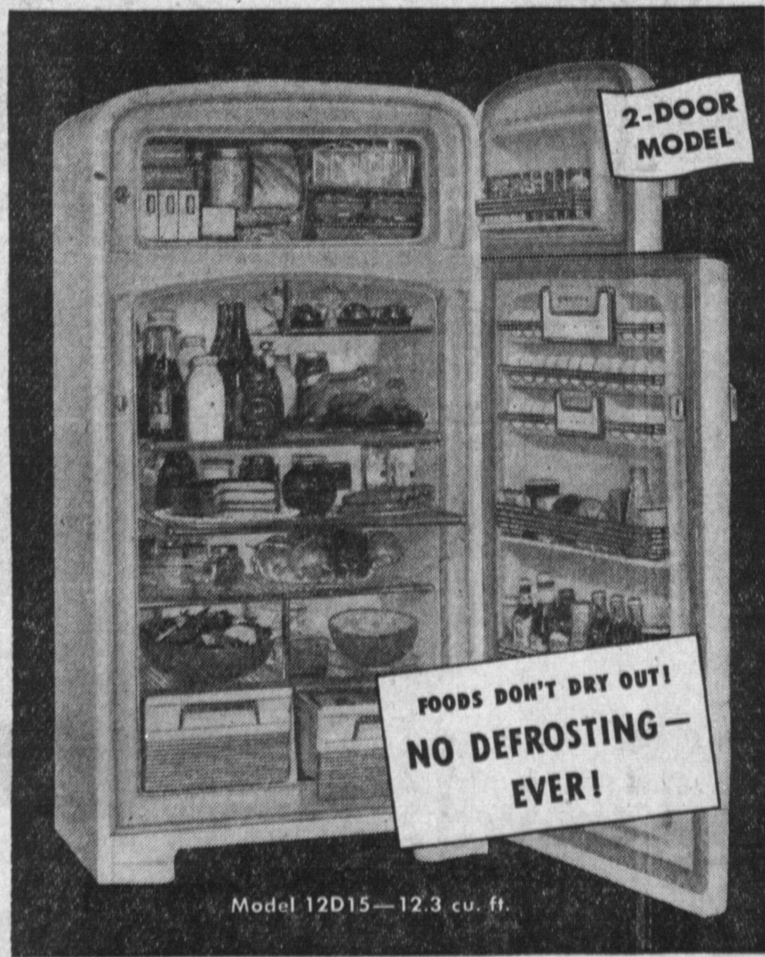
Model 12D15—12.3 cu. ft.

Spacious "Moist-Cold" Compartment keeps foods dewy-fresh for days. No covers or wraps needed . . . Ultra-Violet Lamp keeps air sweet, clean, flavor-fresh