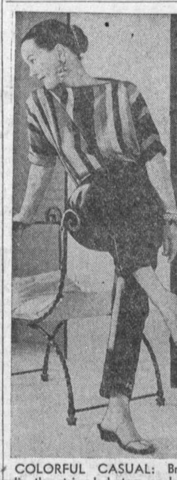
COLORFUL CASUAL: Brilliantly striped bateau-necked overblouse tops slender black torero pants for hostess