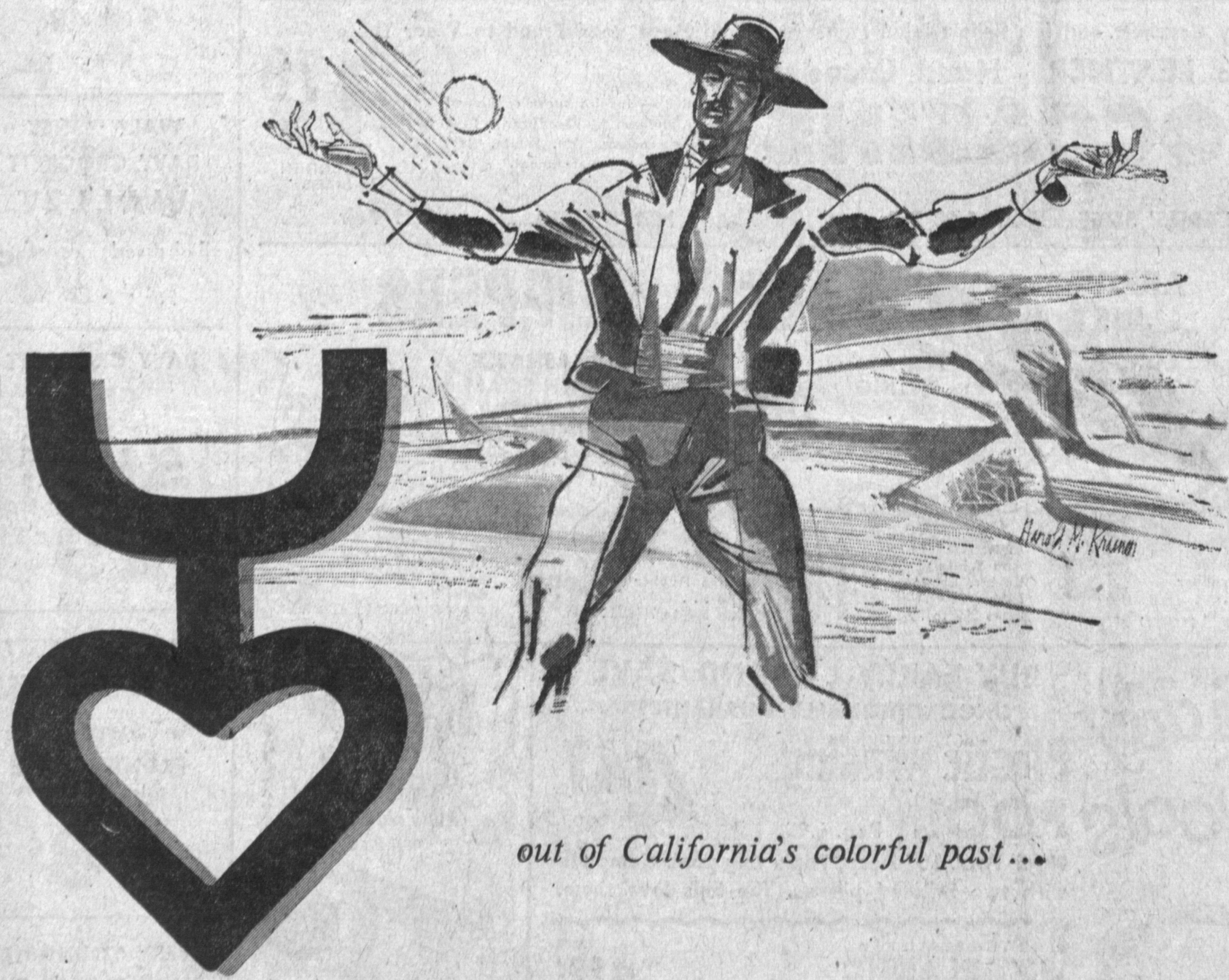
out of California's colorful past...