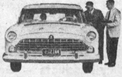
Hudson Wasp 22.1