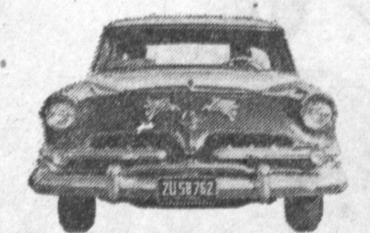
Dodge Custom Royal 22.3