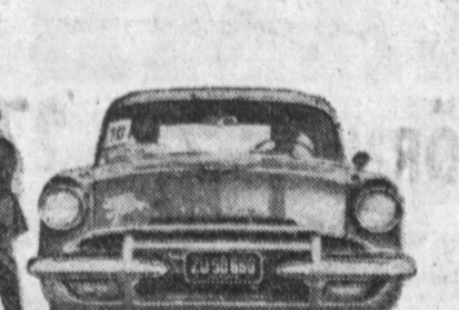
Packard Patrician 18.7