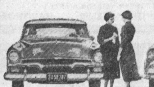
Plymouth Belvedere V8 19.3