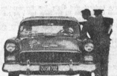
Chevrolet Bel Asr 6 21.5

1418 Marcelina Ave., Torrance FA. 8-4444