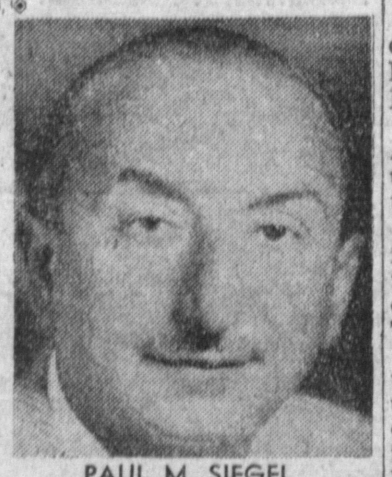
· · · president