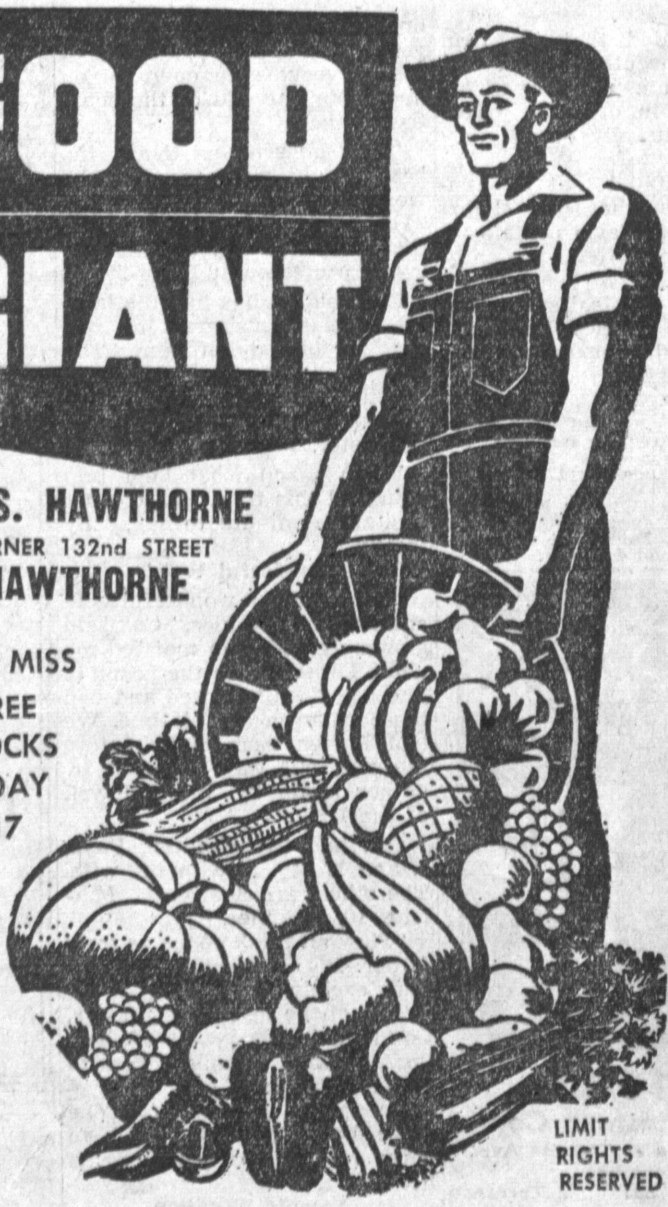
LIMIT RIGHTS RESERVED

Flown From Ireland By Pan-American Airways