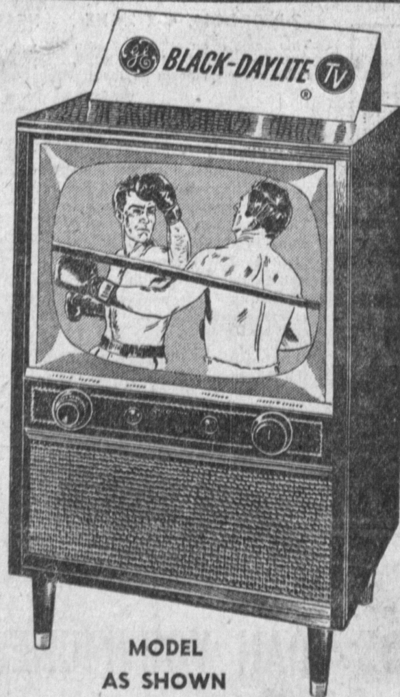
MODEL AS SHOWN

SEE US FOR THE MOST COMPLETE SELECTION OF G.E. TV IN TORRANCE