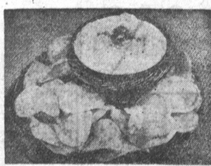
CLAM DIP APPETIZER

Beat whites and yolks of three eggs separately. Fold yolks into whites, add salt and pepper to taste. Pour onto well greased griddle. Cook slowly, then place in slow oven 300°. Lay Velveeta slices on top of Omelette and return to oven long enough to melt Velveeta. Serve with jelly, garnish with water chest.