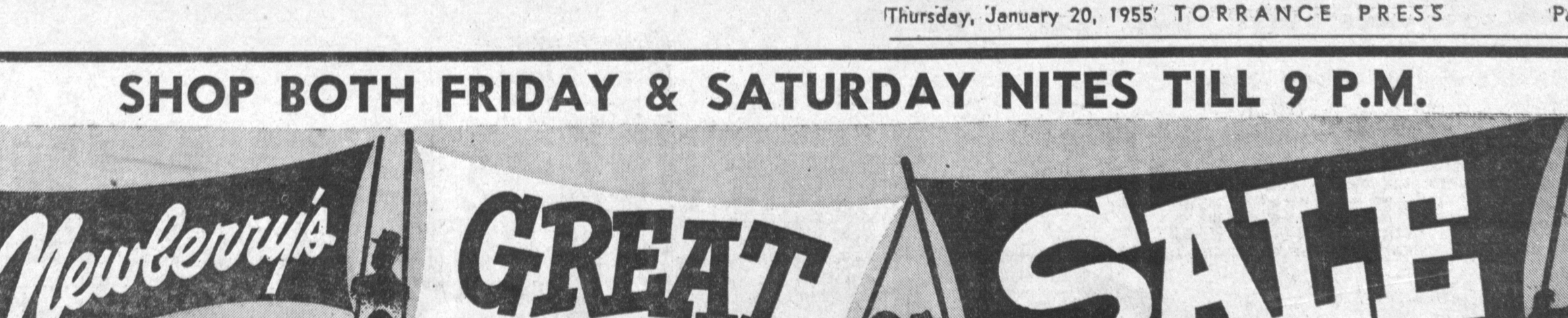
Come See! Come Save! It's Newberry's Greatest Sale! And the Value-ful Items for All the Family and Your Home are More Plentiful ... Lower in Price Than Ever!!!

ter brought up a bunch for us to read. (Signed)