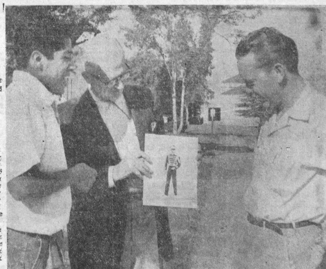
IN STYLE... Torrance Tartar band will soon sport snappy uniforms which will look similar to those worn by West Point cadets. Admiring a design of the maroon-colored outfit with

THE CHRISTIAN CHURCH OF TRUTH (Spiritualist)—Masonic Hall at 1006 1/2 Garden Blvd. Sermon, Healing, Spiritual Messages, Sunday School at 10:15 A.M. Morning Worship at 11:00 A.M. We extend a cordial invitation to the public.